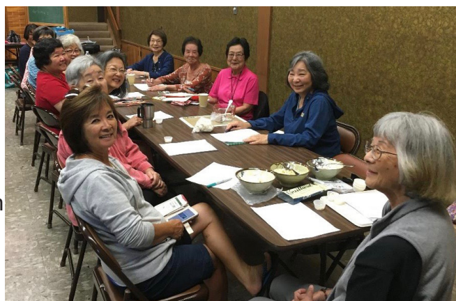
(Meeting in 2019 discussing events & projects)

We are looking forward to the day when we can again meet at church for our bi-monthly gatherings.