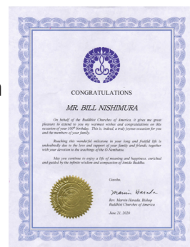
Certificate from BCA